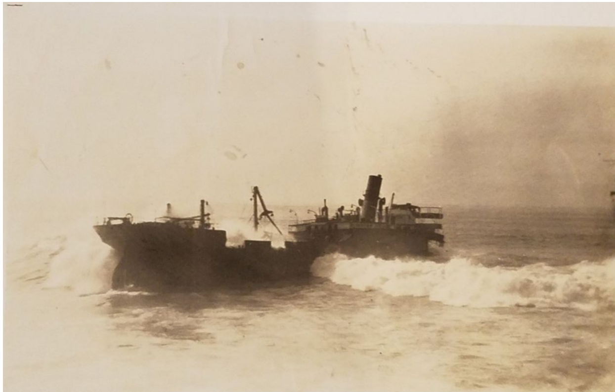
Figure 4 NORLINA breaking up in Gerstle Cove, 1926.