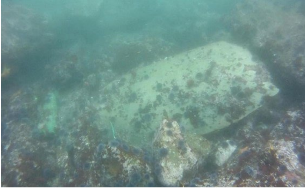
Photo 8 Hull fragment, detailed view looking south (Harreld 2019b)