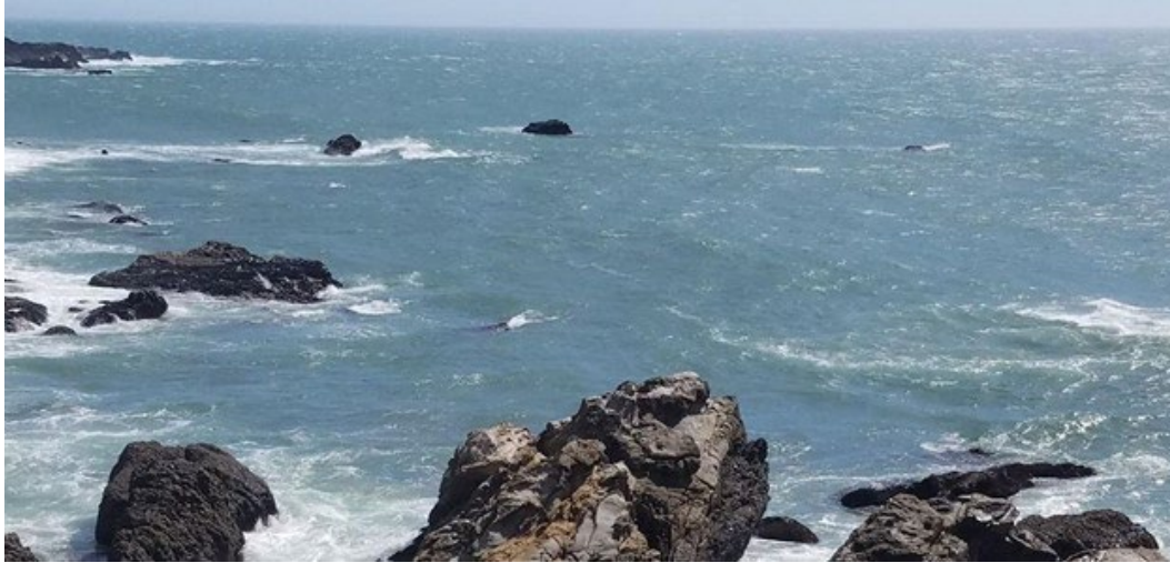
Photo 2 View west from shore looking toward the wreck site with vessel fragment exposed at low tide (Harreld 2019a)