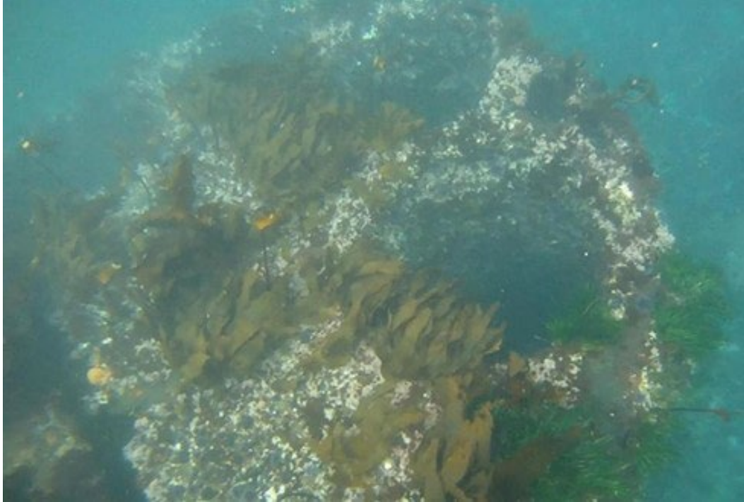
Photo 6 Boiler two or two (closer to drive shaft), detailed view looking north (Harreld 2019b)