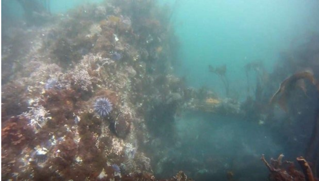
Photo 4 Drive shaft, detailed view looking northwest (Harreld 2019b).